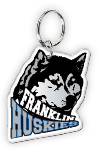
4" SQUARE PREMIUM ACRYLIC KEY RING ITEM# 13238

*Sponsor pays full cost of product; allowing organization to make a larger profit.