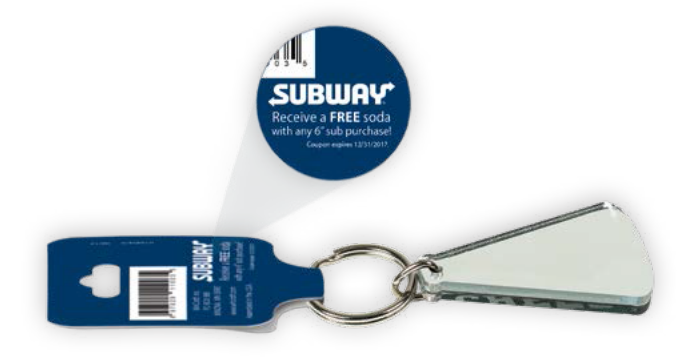
MIRROR BACKING/PACKAGING BACK IMPRINT - SPONSOR PROMOTION ITEM# 13238CPN